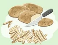
1. Cut the potatoes