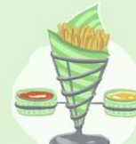
8. Serve fries!