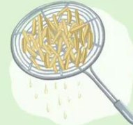
4. Fry potatoes