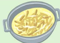
6. Fry until golden