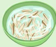
2. Soak the potatoes