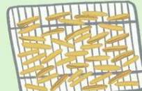
7. Drain the fries