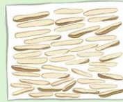
3. Drain & dry the potatoes